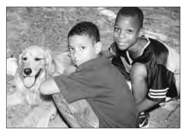
Visiting dogs are a favorite with PAL campers.

The camp, a collaborative project between PAL and the Beacon House Community Ministries, is housed in a neighborhood center. Beacon House staff are familiar with the many children who reside in the area housing project. Staff typically choose more than 30 campers, ages eight to 12, to participate in the six-week program. Campers are responsible for the care of rabbits, guinea pigs, gerbils, birds, and fish who live on-site. Over the course of the program, each child is given an opportunity to care for every animal. In addition to tending to and studying about the animals, children enjoy visits from several