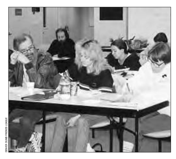
Teachers spend a Saturday learning about the connection between animal cruelty and other forms of human violence during the Dumb Friends League's portion of a recertification humane education course.

The class is held at the DFL's education center on two consecutive Saturdays. Typically, 10 to 15 teachers enroll in each Teaching Compassion and Respect for ALL Living Things: Humane Education in the Classroom (K–12) class. The Link Between Animal Abuse, Child Abuse, and Violent Crimes portion of the course is broken into four sections: examples of previous crimes, identification of students with signs of this behavior, response to incidents, and a discussion with a DFL Animal Cruelty Investigator. The $105