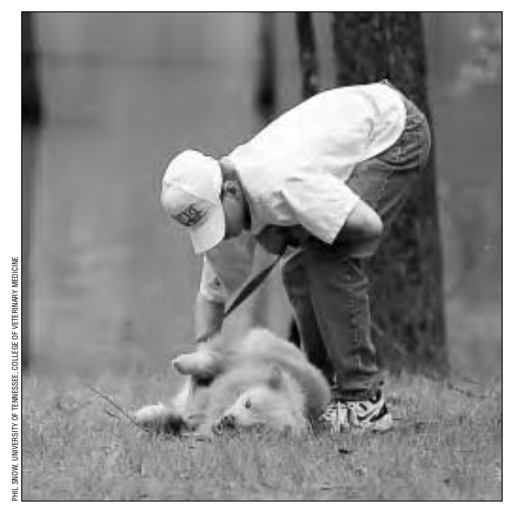
A HALT student trainer gives a gentle pat to his relaxed partner. Student trainers report an increase in patience and confidence.

Six basic goals provide the framework for the four-week HALT dog training programs: 1) to offer adolescents an opportunity to develop a positive sense of accomplishment, self-worth, and pride; 2) to offer adolescents an opportunity to improve specific living skills such as assertiveness, patience, staying on task, communication, and commitment; 3) to introduce adolescents to career opportunities in animal-related fields; 4) to provide a successful