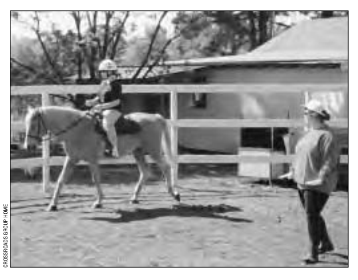
A ride around the fenced ring helps Crossroads residents develop a sense of pride and self-confidence unequaled through more conventional therapies.

Animal-assisted therapy is a unique feature of the residential therapy program. Twice a week the girls participate in guided one- to two-hour sessions that include the care and training of companion and farm animals, with emphasis placed on horseback riding and equine care. Nonstructured interaction with the resident animals, however, can occur at anytime when the girls pet, hug, or just hang out with one of the many resident rabbits, cats, or dogs.