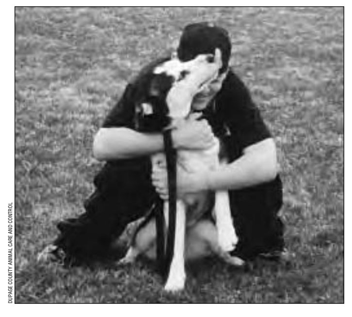
A hug from a Cooperative Canine Training Program trainer elicits a big, wet dog kiss. The program emphasizes positive relationships as much as dog training.

Planning each session begins with DuPage County Animal Care and Control staff selecting six dogs for training. DuPage County Animal Care and Control's public education officer and the group home staff discuss the attributes and needs of each dog. Six trainers are selected based on their own needs and issues. Dogs are then matched with group home residents. A resident who has a hard time trusting others may be paired with a timid dog. A student with low