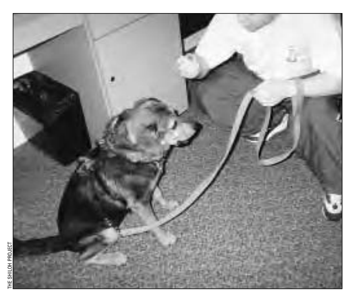
An adolescent and Shiloh dog Elsie practice "off" and "take it."

The Shiloh Project's goals include providing juvenile offenders and at-risk youth with an opportunity to experience a healthy, nonviolent experience with a dog; to learn how to properly care for and train companion animals; and to learn how to identify and report animal abuse and neglect. In addition, the organization seeks to educate participants and the public about the importance of adopting homeless dogs, pet overpopulation, and the animal cruelty/human violence connection.