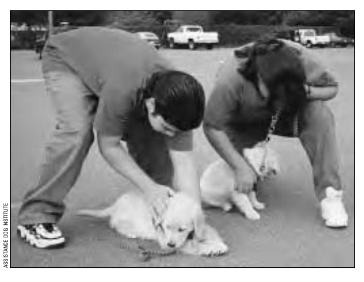
High Schooled Assistance Dog Program participants learn to train puppies with gentle coaxing and praise.

There are three participating schools—one for incarcerated youth and two for teens on probation who live either in a group home or at home with their parents or guardians. Student trainers meet with their dogs for an hour or two daily over the course of six months. Weekly field trips with the course instructor to business meetings, school functions, and other public settings give the students an opportunity to demonstrate how well their dogs are responding to the training. Students living at the residential facility are able to have their dogs spend the night with them once a week. Those visits are