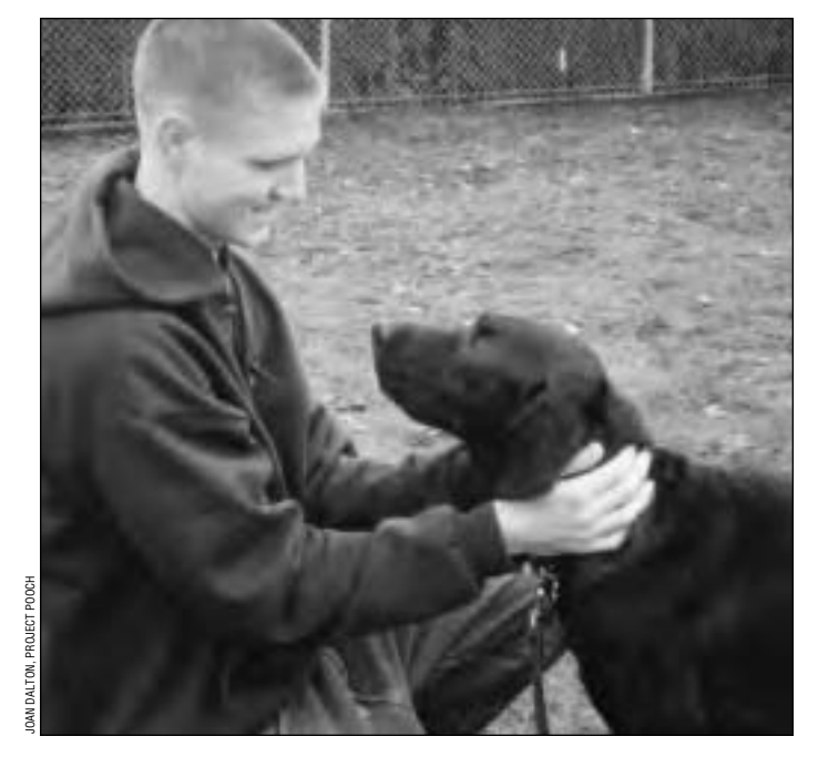
A MacLaren resident is greeted by adoptable dog Desiree, who is always happy to see him.

The young men are responsible for all aspects of dog care, from keeping track of the food supply to cleaning the kennels and the grounds. The handlers and dogs are together for six hours a day, seven days a week. Guest lecturers teach the participants about pet overpopulation, grooming, first aid and safety, and humane laws. Throughout the program emphasis is placed on the treatment of all living things, including campus plants and wildlife such as squirrels and birds. The young men also participate in treatment groups in their living units, and they must abide by campus rules and rules specific to their resident cottages.